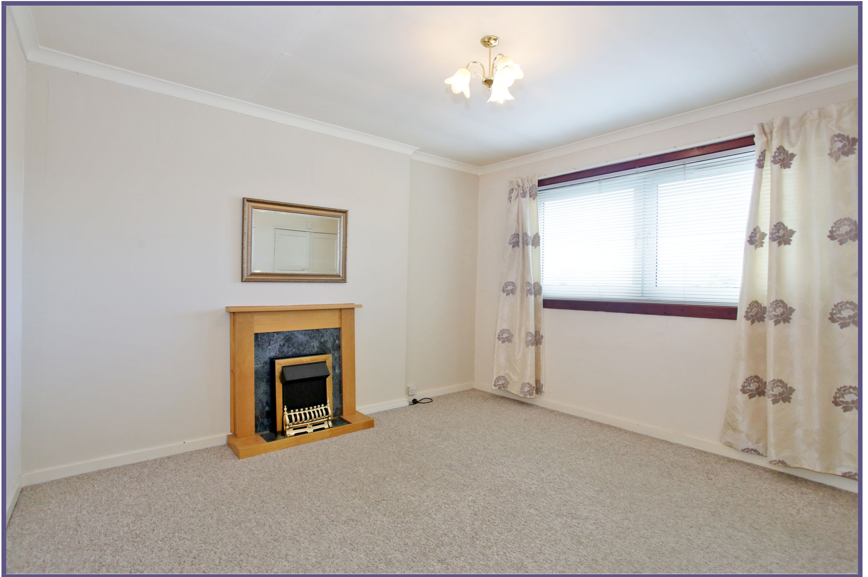
Double Bedroom/Dining Room